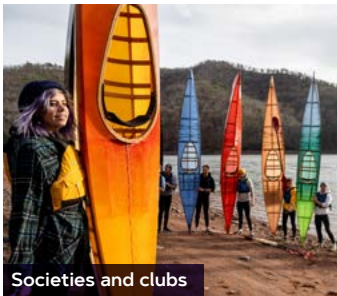
Societies and clubs