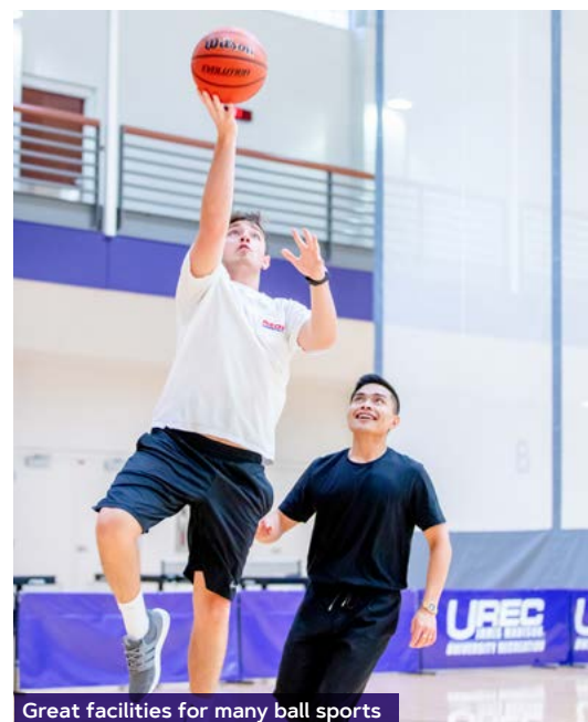
Great facilities for many ball sports