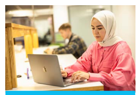
Merit scholarships are available. See page 9

At the University of Huddersfield - London, we specialise in teaching international students. All tutors will either be academics with a PhD / other advanced degree or they are working in their field with a Master's qualification, meaning you'll be gaining a world-class education.