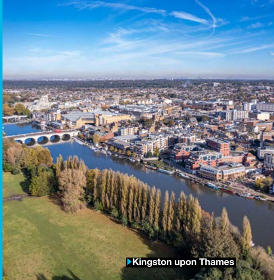
Kingston upon Thames