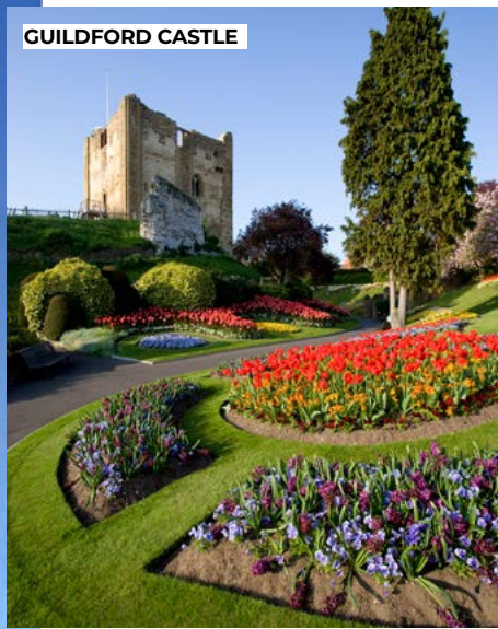
GUILDFORD TOWN CENTRE