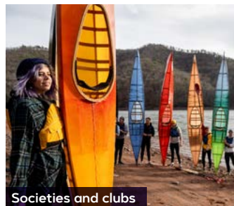
Societies and clubs