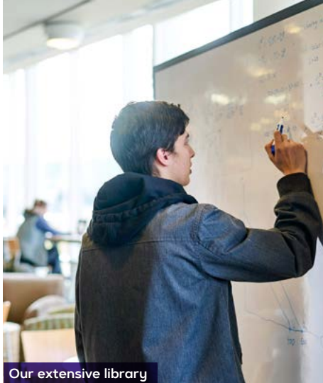
Our extensive library

Biology BA/BS Biophysical Chemistry BS Biotechnology BS Chemistry BS Computer Information Systems BBA Computer Science BS Earth Science BA Engineering BS Geology BS Information Technology BS Intelligence Analysis BS Mathematics BA/BS Physics BA/BS Quantitative Finance BS Statistics BS