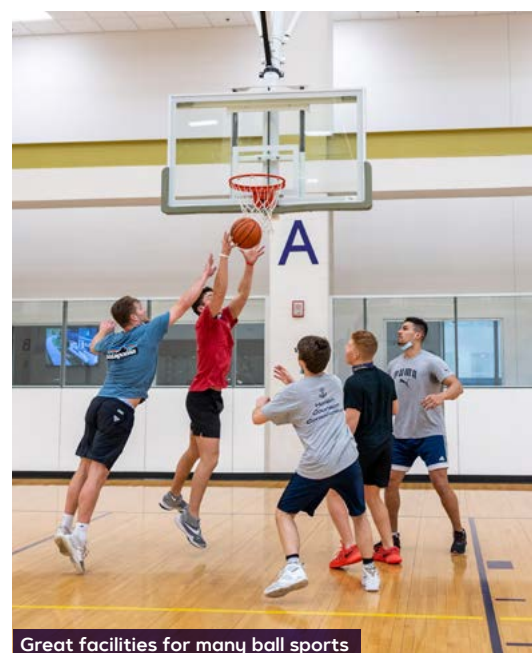
Great facilities for many ball sports