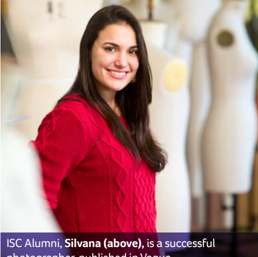
photographer, published in Vogue.