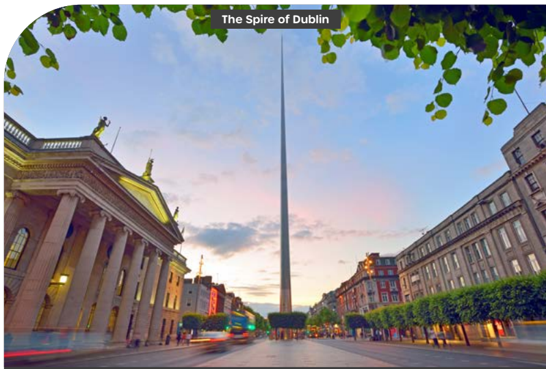
The Spire of Dublin