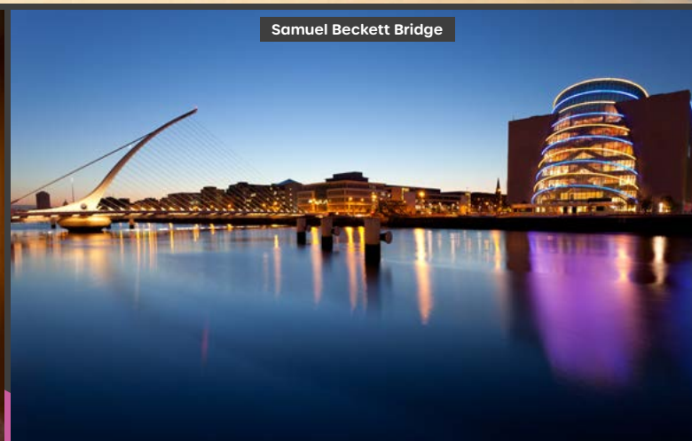
Samuel Beckett Bridge