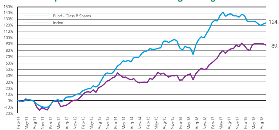
The graph shows the cumulative performance under Downing management (since Feb 2011)