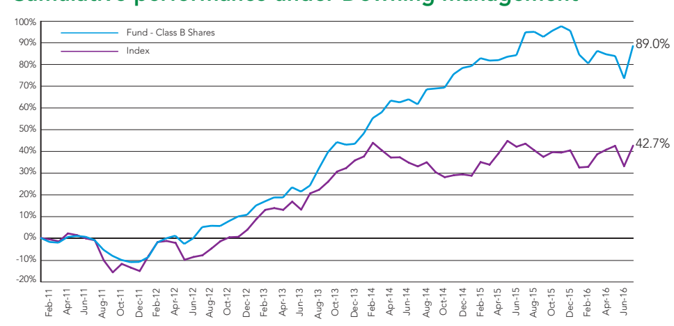
The graph shows the cumulative performance under Downing management (since Feb 2011)