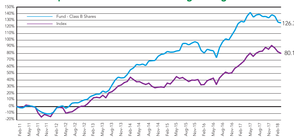
The graph shows the cumulative performance under Downing management (since Feb 2011)