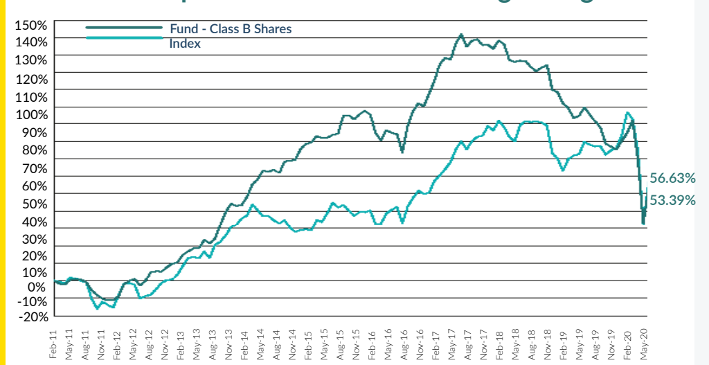
The graph shows the cumulative performance under Downing management (since Feb 2011)