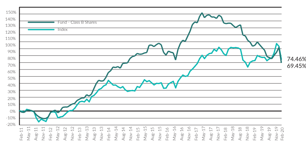
The graph shows the cumulative performance under Downing management (since Feb 2011)