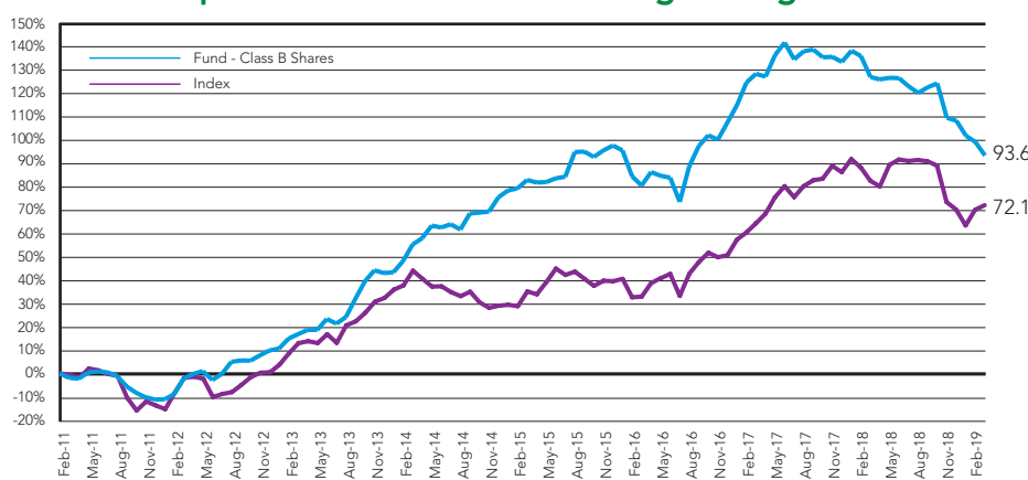
The graph shows the cumulative performance under Downing management (since Feb 2011)