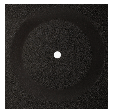
Duraform BP wrinkle polyester offers high abrasion resistance