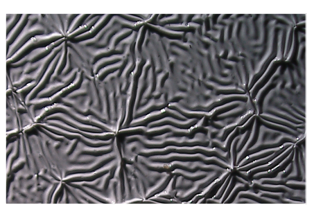
Surface texture magnified 35 times

This document contains general information only and should not be construed as creating any warranties, express or implied. The technical data presented in this bulletin is based upon information believed by PPG to be currently accurate. However, no guarantees of accuracy, comprehensiveness, or performance are given or implied. Continuous improvements in coatings technology may cause future technical data to vary from what is printed in this bulletin. Please contact a PPG representative for additional information. Duraform and the PPG Logo are registered trademarks of PPG Industries Ohio, Inc. Taber is a registered trademark of Taber Industries. ©2017 PPG Industries, Inc. All rights reserved. PPG-140 06/17