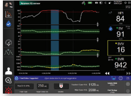
Acumen Assisted Fluid Management software screen

HemoSphere monitor offers full-range cuff, sensor, and catheter compatibility designed for individualised patient management. With expanded capabilities and predictive algorithms, HemoSphere monitor offers actionable insights to help you stay ahead of critical moments.