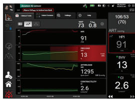
Acumen smart trends screen