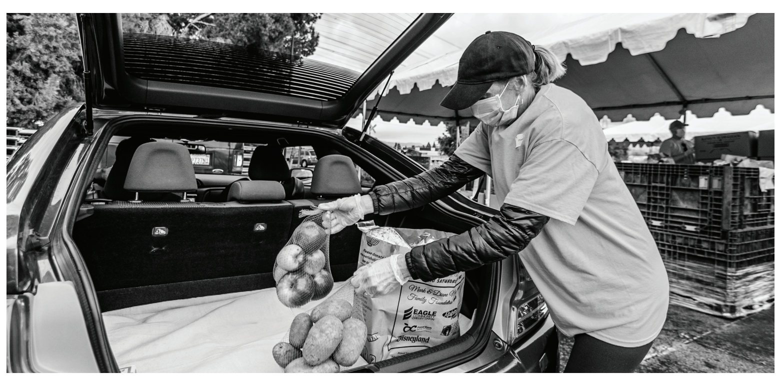
and taken at their pop-up drive-thru food distribution earlier this year.

Others have organized drive-through food donation programs. Many have contributed to local relief efforts. In addition to these heartfelt acts of personal kindness, the Edwards Foundation has quickly made resources available to organizations around the world to support those who need help most. We are fortunate to have been able to help feed underserved communities in Australia, New Zealand, Canada, Costa Rica, Czech Republic, Dominican Republic, India, Israel, Japan, Puerto Rico, Singapore, and in the United States in California and Utah.