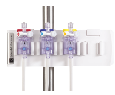
Three TruWave disposable pressure transducers with 3 cc flush device and trifurcated IV set; tubing length and color options available

Edwards Lifesciences TruWave disposable pressure transducers offer advanced design features to ensure waveform accuracy and pressure monitoring reliability.