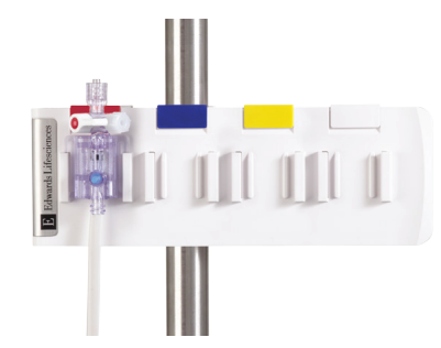
Single TruWave disposable pressure transducer with 3 cc flush device and IV set; tubing length and color options available