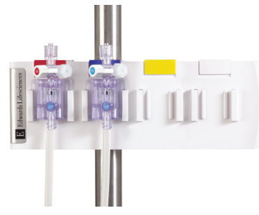
Two TruWave disposable pressure transducers with 3 cc flush device and bifurcated IV set; tubing length and color options available