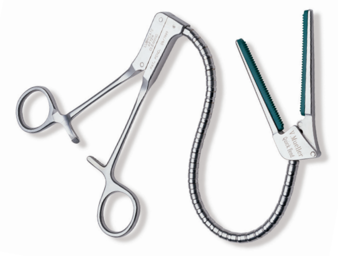
Cosgrove Flex Clamp QuickBend Clamp with EverGrip Inserts