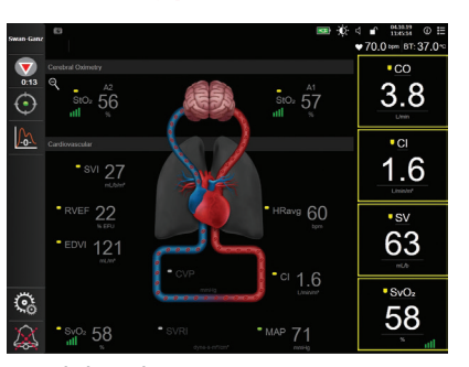
Visual clinical support