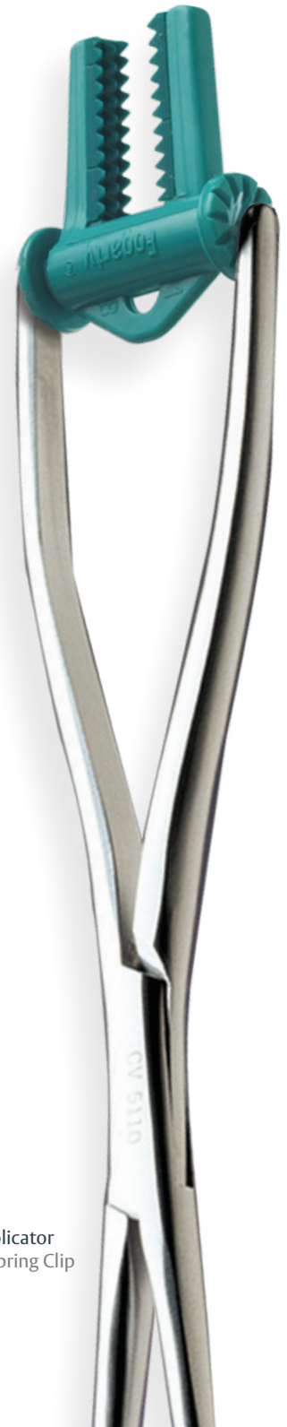
Spring Clip Applicator with EverClip Spring Clip

The spring clips and handleless clamps are radiopaque for visualization under fluoroscopy