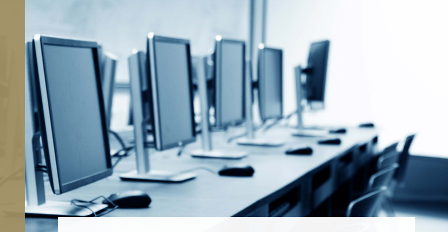
TABLE OF CONTENTS >

ARRT's exams measure the knowledge and cognitive skills you need to perform the tasks typically required in your discipline. Consult our content specifications for the topics your exam will cover.