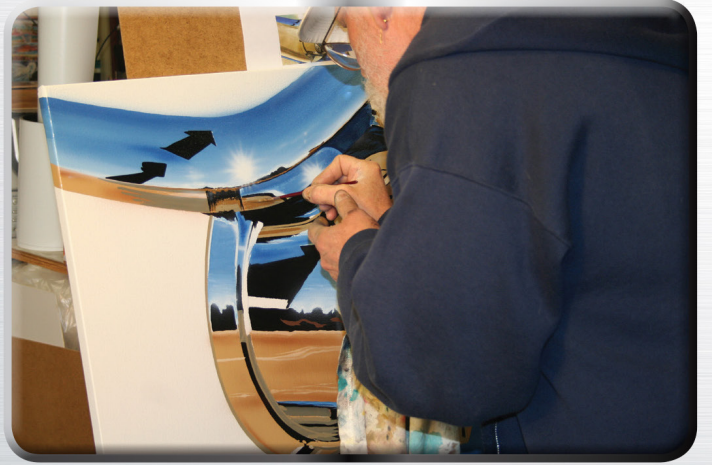
Step 11 - Here I'm adding a little brown into the areas.