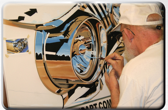
Step 8 - Continue blending in darker blues.