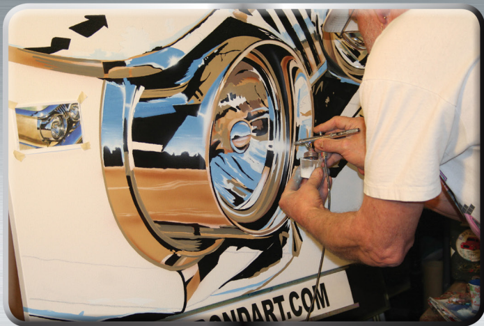
Step 9 - Now I'm adding white highlights using my Iwata Eclipse Airbrush.