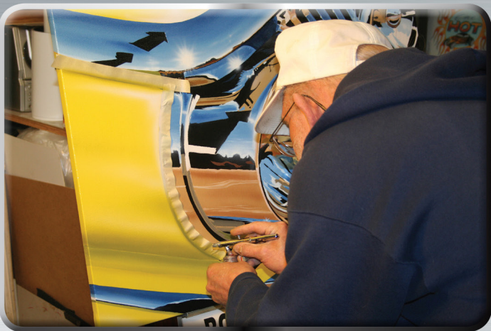
Step 14 - I used masking tape to cover the chrome areas and am airbrushing dark highlights into areas.