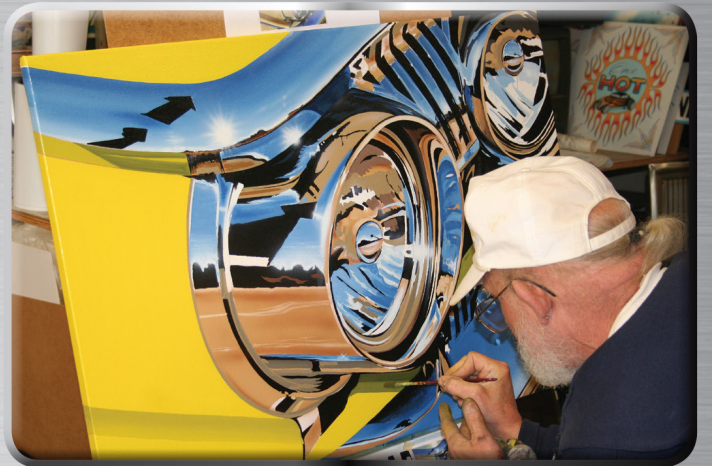
Step 13 - I next darkened the yellow with a small amount of black and paint in the shadow areas.