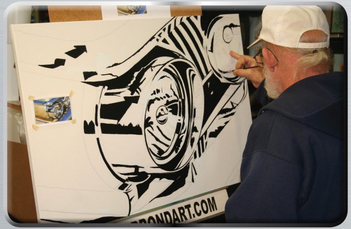
Step 2 - Now it's time to paint. I began by painting in all of the black areas.