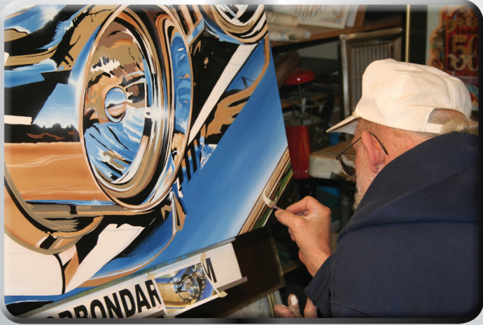
Step 10 - For the fine lines, I always opt for a striping brush.