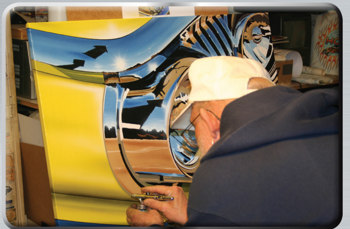
Step 15 - Now I'm blending the shadows a little more with the airbrush.