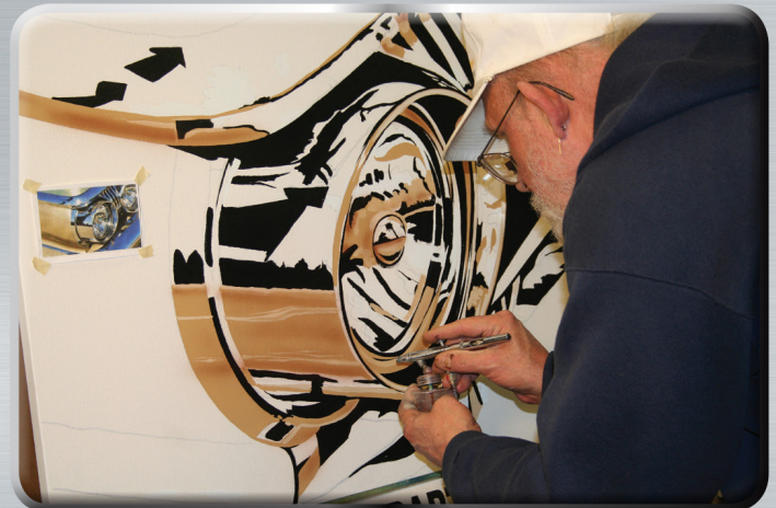
Step 4 - Here I'm airbrushing a darker color into areas.