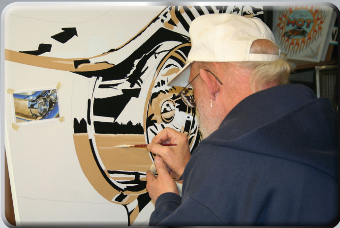
Step 3 - Next I used a light tan color for the ground areas.