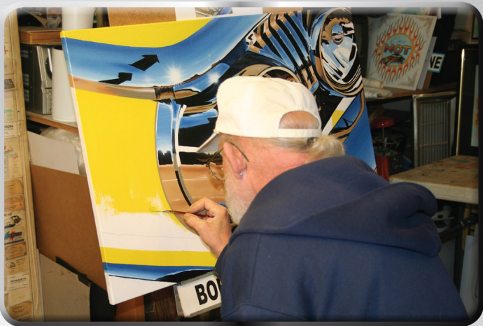
Step 12 - Now It's time to brush in the color of the car, here I used Primrose Yellow.