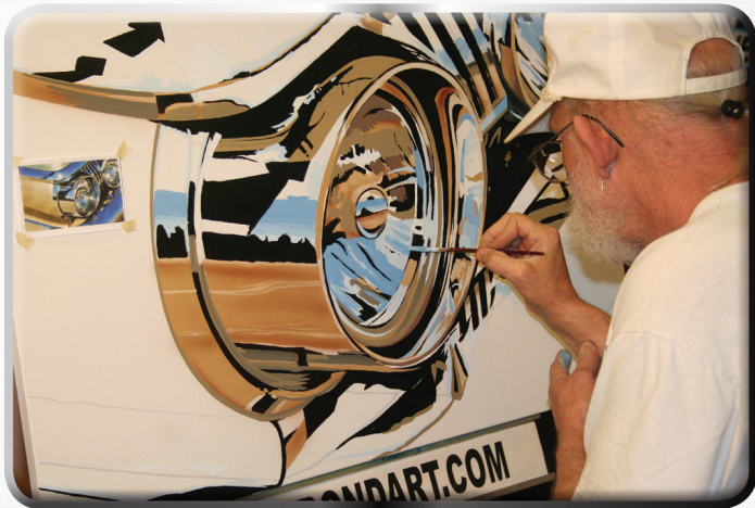
Step 7 - Now it's time to blend in the darker blues.