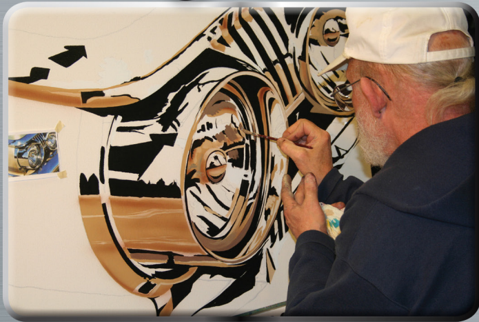
Step 5 - With the light tans completed, I move on to a darker tannish brown.