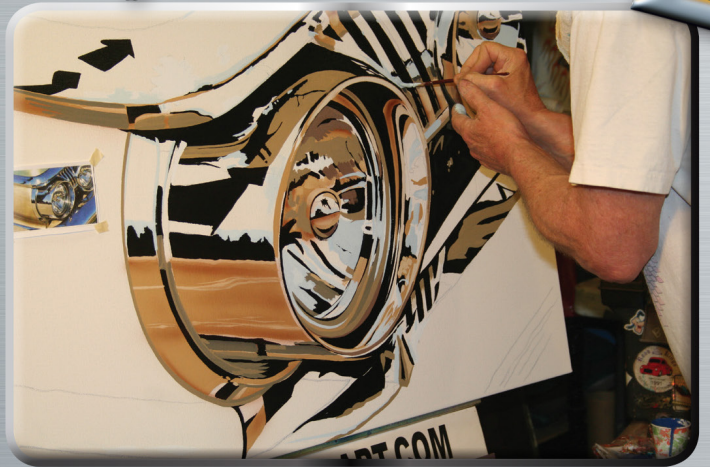
Step 6 - Next comes the light baby blue.