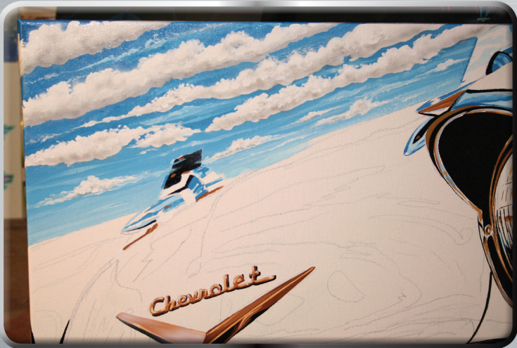
7 - Here I painted in some white clouds and airbrushed light gray to the bottom section of the clouds.