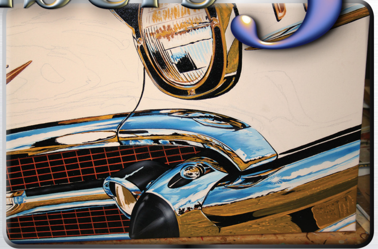
6 - While the blue sky sets up I went back to the tan colors in the headlight.