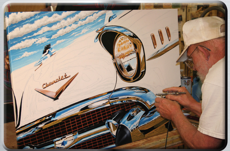
8 - Here I'm adding just a little white with my Iwata airbrush to soften the brush-blended blues.