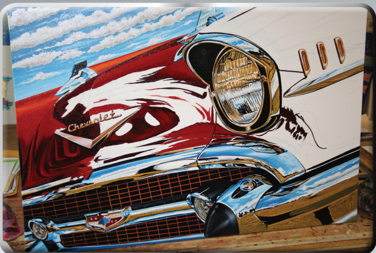
9 - Now onto the next color sections, here I'm painting various reds into their proper place.