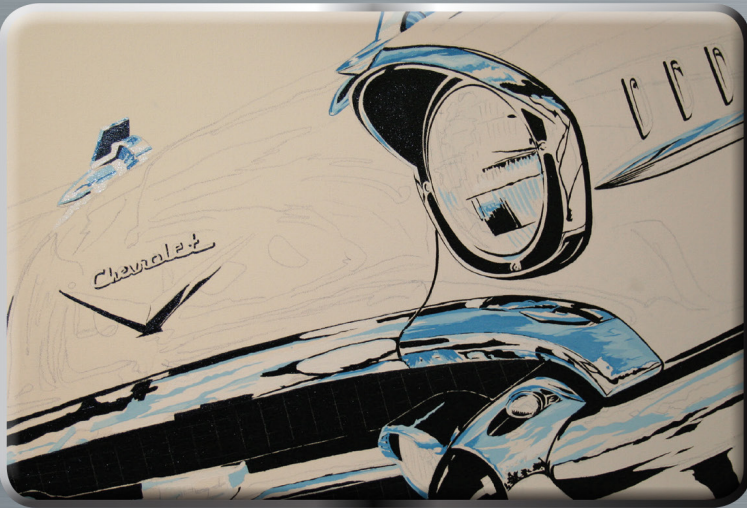
1 - I first enlarged the photo onto canvas. Then I painted in all the black areas and then began with a very light blue and added a medium blue.