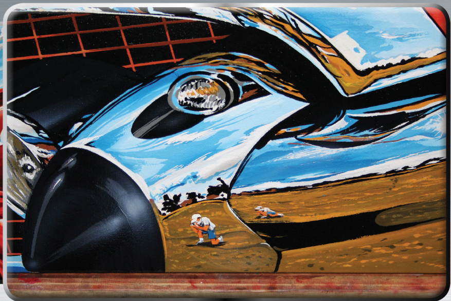
16 - Lastly I added a small touch by painting myself into the painting.