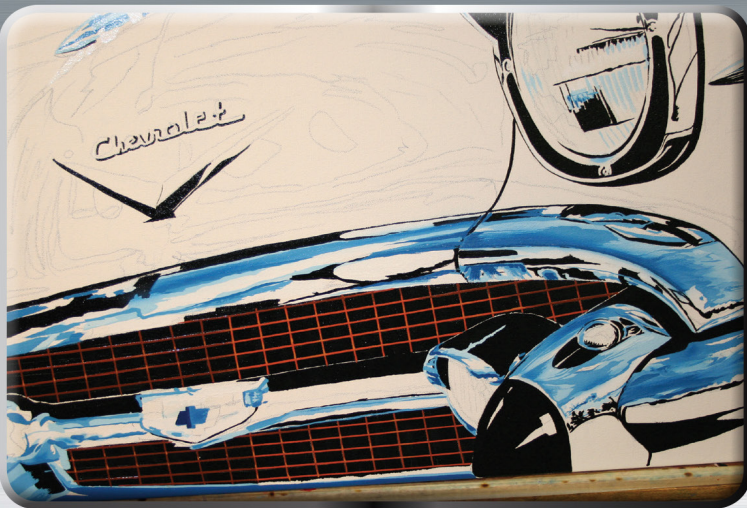
3 - Here I used a striping brush and laid in the grill stripes. Notice they're not all the same color. Some are darker because of shadows.