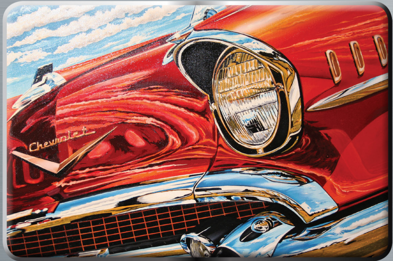
14 - Now it's almost complete but the clouds need some help.