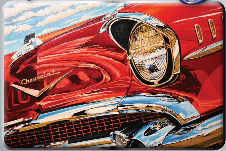
12 - Continue on with lighter and darker shades of red.