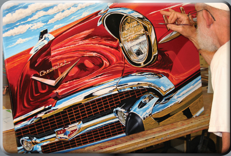
13 - Here I'm doing some blending to soften color changes.