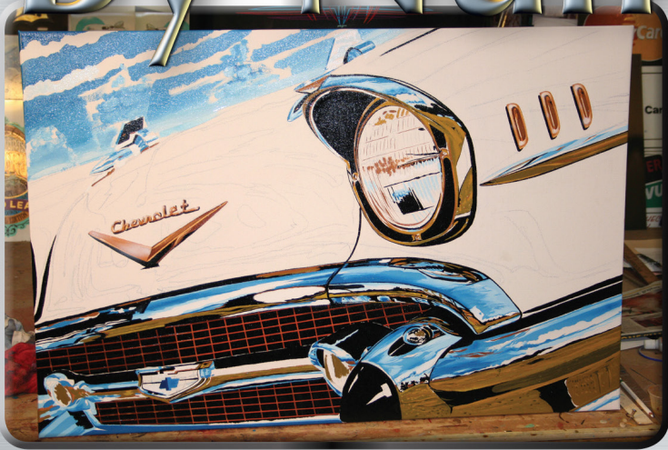
5 - Now it's time to paint in the sky, leaving white areas for clouds to be added.