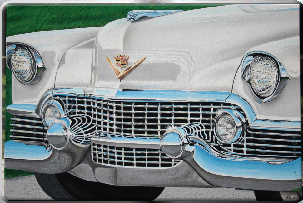
Here are two other paintings I did using the same technique.