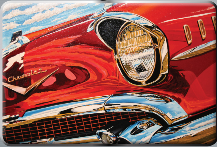
11 - This part shows the various reds painted into the clouded area on the hood.