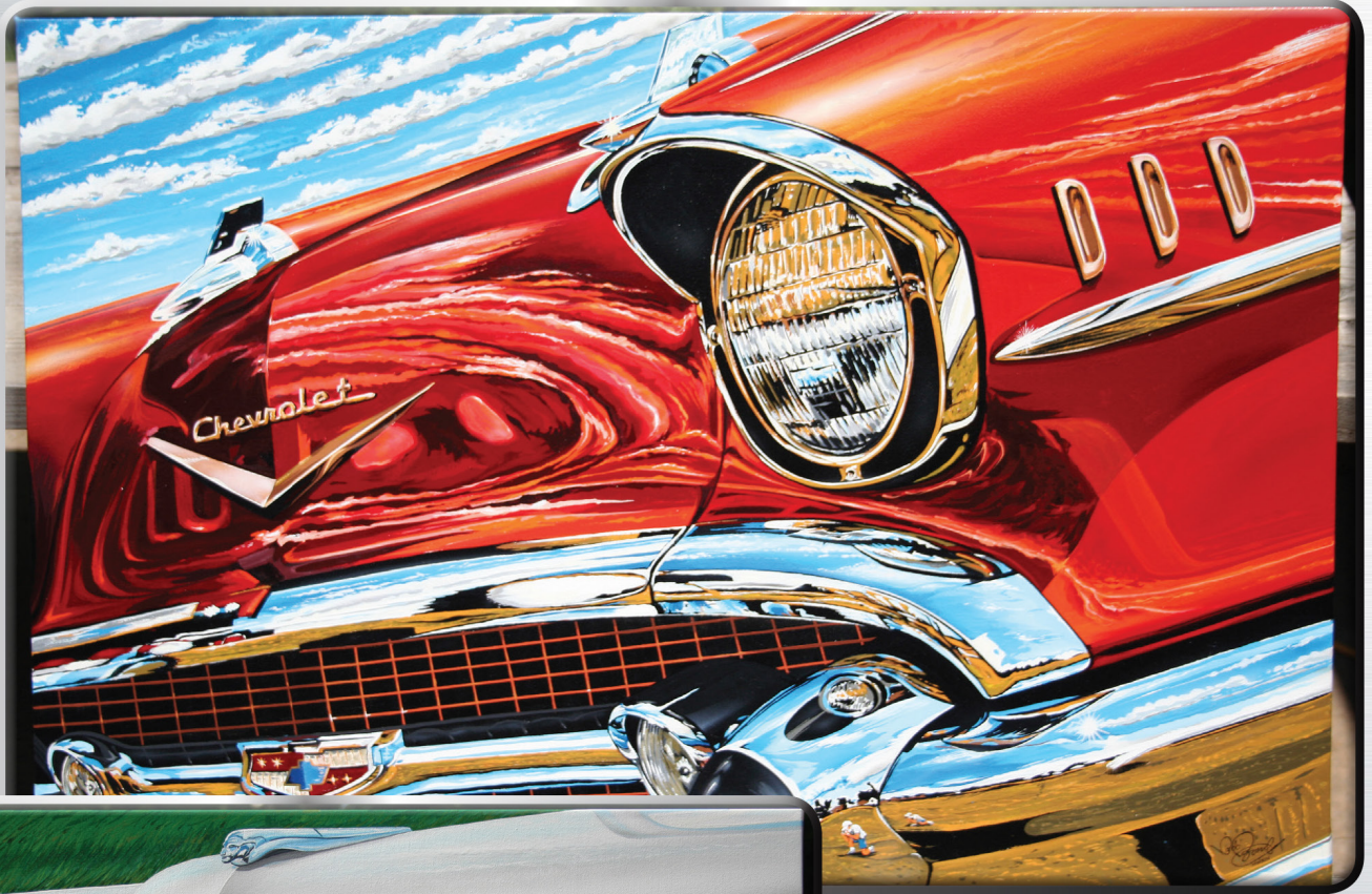
Finished art 24" X 36"