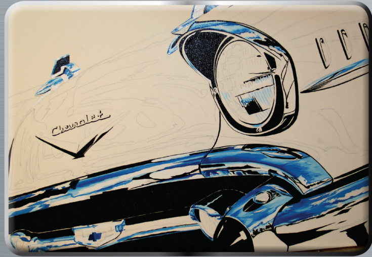
2 - Next I continued by adding darker shades of blue.