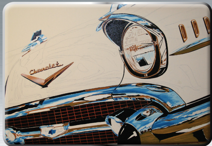
4 - Now it's time for color #2 - tans/browns. Here I painted in all the areas reflecting the ground and Chevrolet emblems.