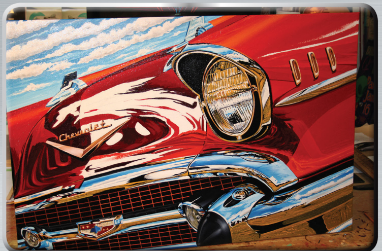
10 - Continuing with shades of red/maroon, this is so the vehicle will reflect the changing colors in Candy Apple Red.