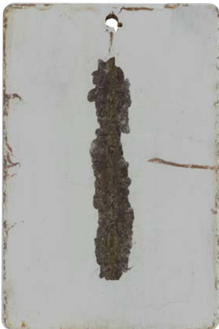
Mono-layer System Topcoat only after 720h NSS