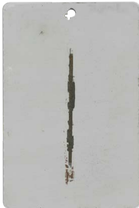
Dual-layer System Primer + Topcoat after 720h NSS

Protective layers are the most durable protection against corrosion. However, there is a performance difference between mono- and dual-layer coating systems.