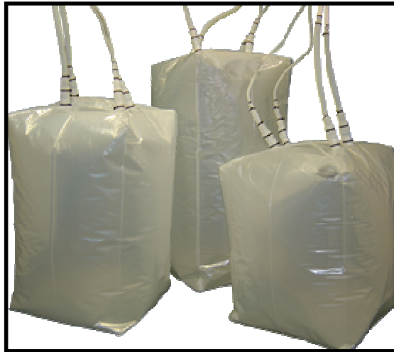
Medium Size Bags: 50 L, 100 L, and 200 L Bags