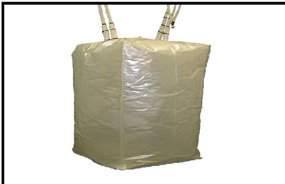
Large Size Bags: 500 L, and 1000 L Bags