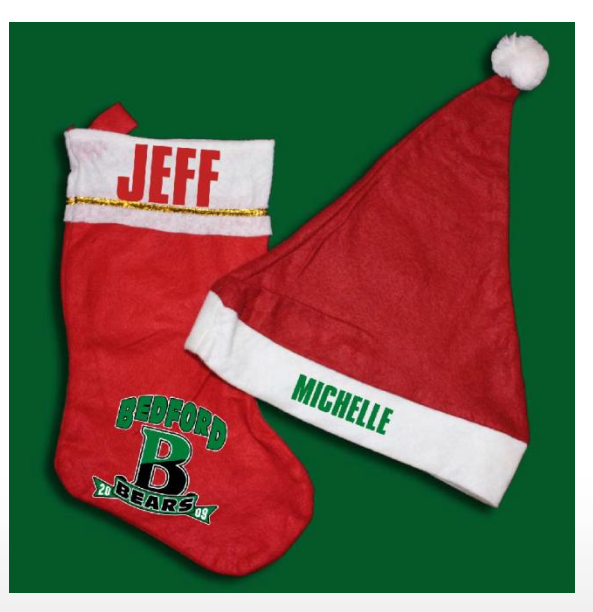
QAL-374 with Express Name