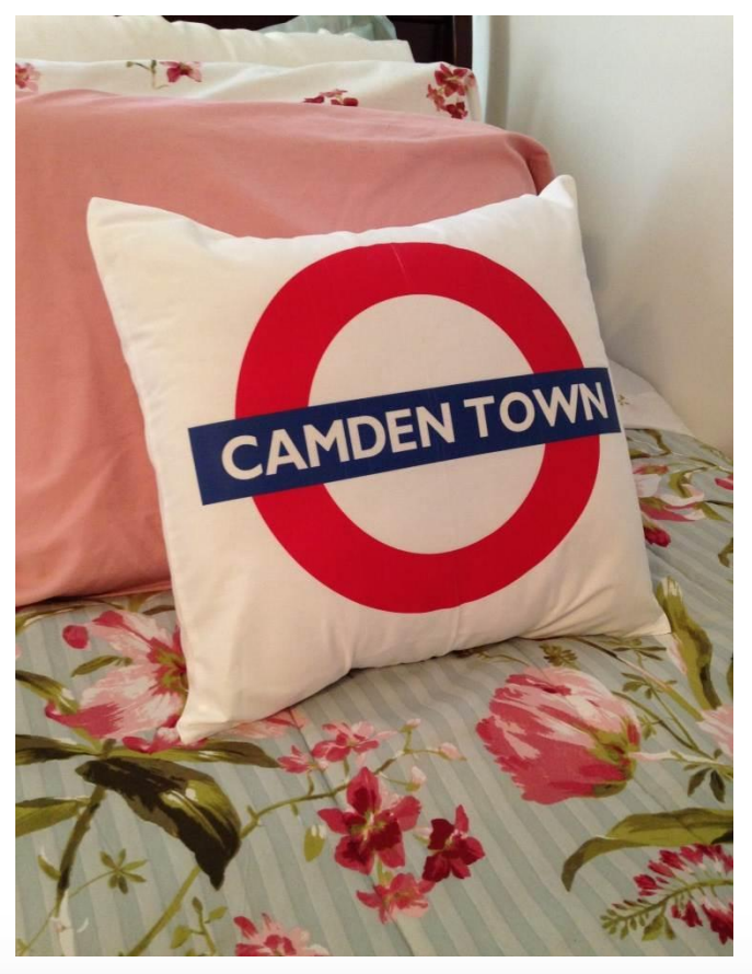
Use Crystal Clear for pillows you will sleep on - stays soft

Throw pillows with Goof Proof® - perfect for soon-to-be graduates