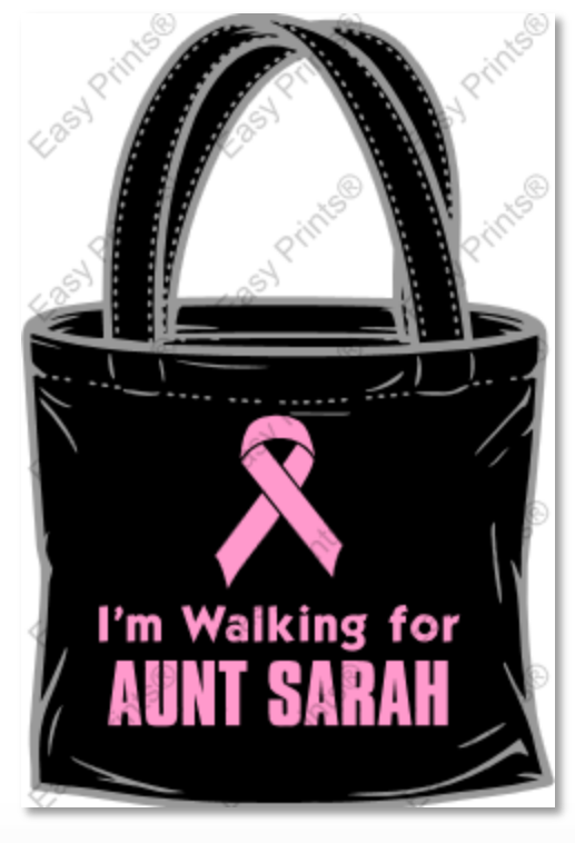
QFD-4 with Express Name