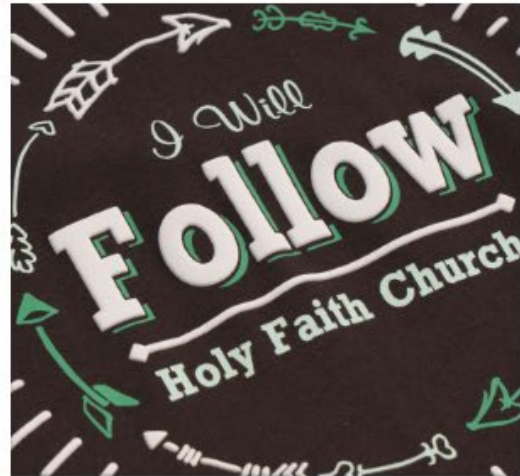
PUFF SCREEN PRINTED TRANSFERS