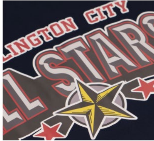
CAD-PRINTZ® EXPRESS MATTE™ 250 DIGITAL TRANSFERS