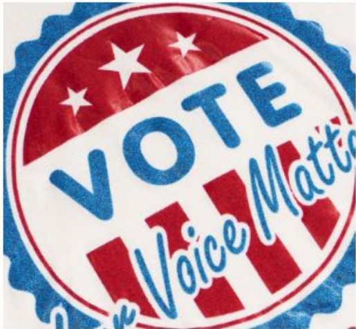
GLITTER SCREEN PRINTED TRANSFERS