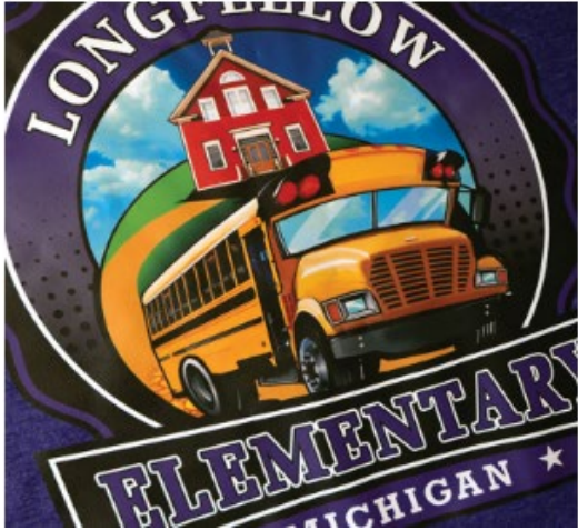
CAD-PRINTZ® EXPRESS PRINT