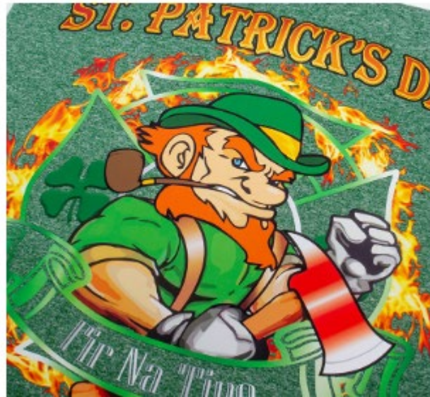
ULTRACOLOR™ STRETCH TRANSFERS