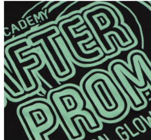
GLOW-IN-THE-DARK SCREEN PRINTED TRANSFERS