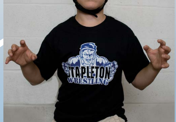
Layout QWR-44 Royal & White Goof Proof®