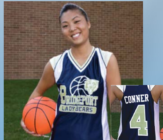
Easy Prints® Layout QBK-54 Vegas Gold and White

(We have matching colors for numbers and fronts designs)