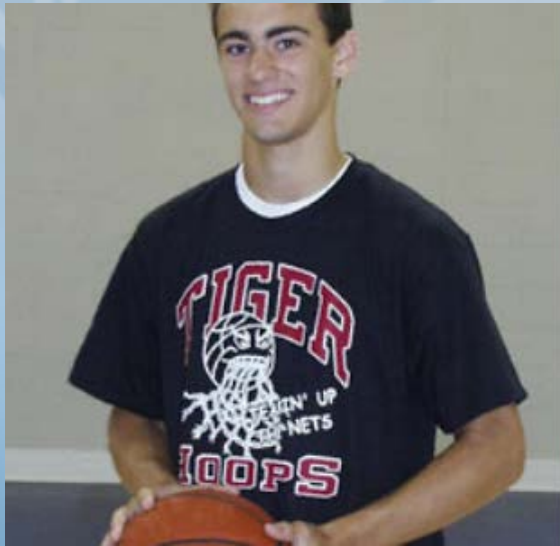
Screen Printed Easy Prints® Layout QBK-87