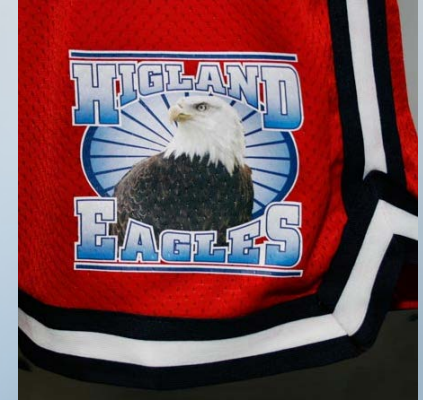
Cad-Printz™ from provided art