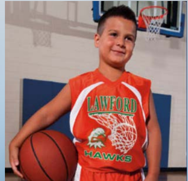
Easy Prints® Layout QBK-7 Kelly Green and White