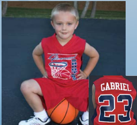
Easy Prints® Layout QBK-3 Navy and White

(We have matching colors for numbers and fronts designs)