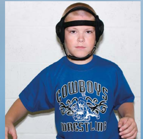
Layout QWR-33 Black & White Goof Proof®