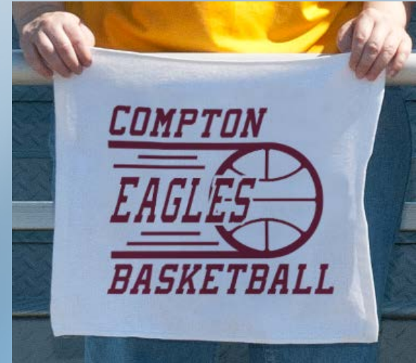
Layout QBK-74 Burgundy Goof Proof® Screen Printed Transfer applied to 100% cotton Rally towel