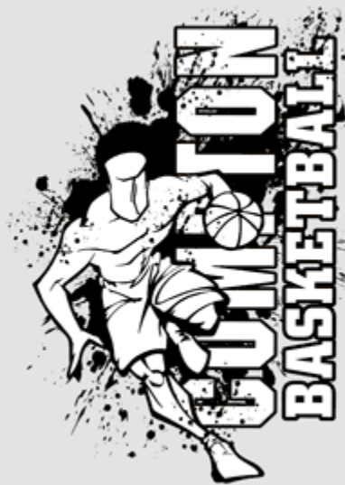
Easy Prints Layout#: QBK-180