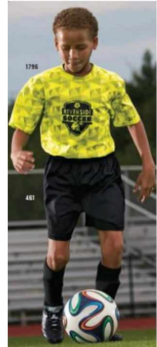
Elevate Wicking Jersey (1796) $7.50