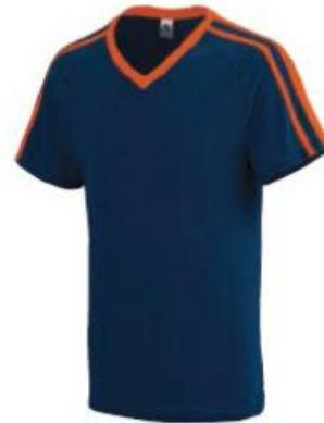
Stripe Tee (364) $6.50