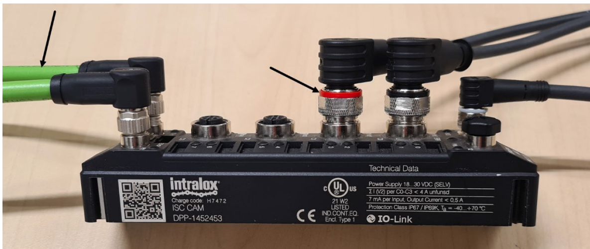
Figure 8: Cable connections and color coding