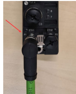
Figure 3: Network cable