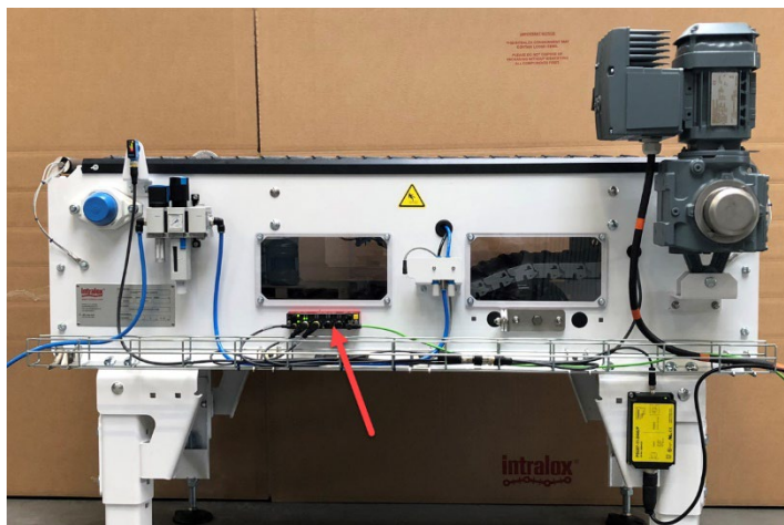
Figure 7: Install ISC CAM to side panel