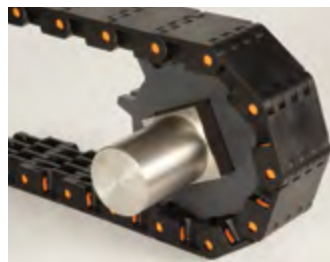
Series 10000 Flat Top MTW 100 mm (3.9 in)