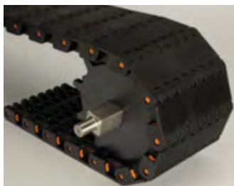
Series 10000 Flat Top MTW 200 mm (7.9 in)