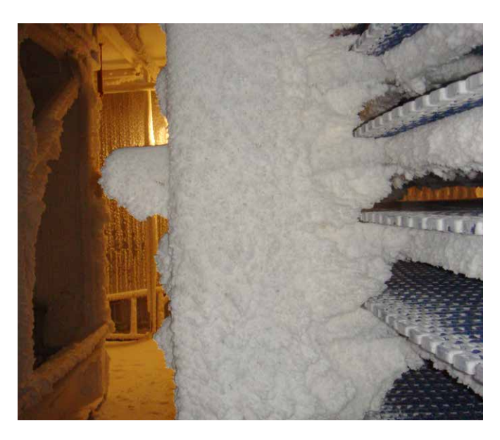
Ice buildup blocks airflow velocity, reducing system efficiency.