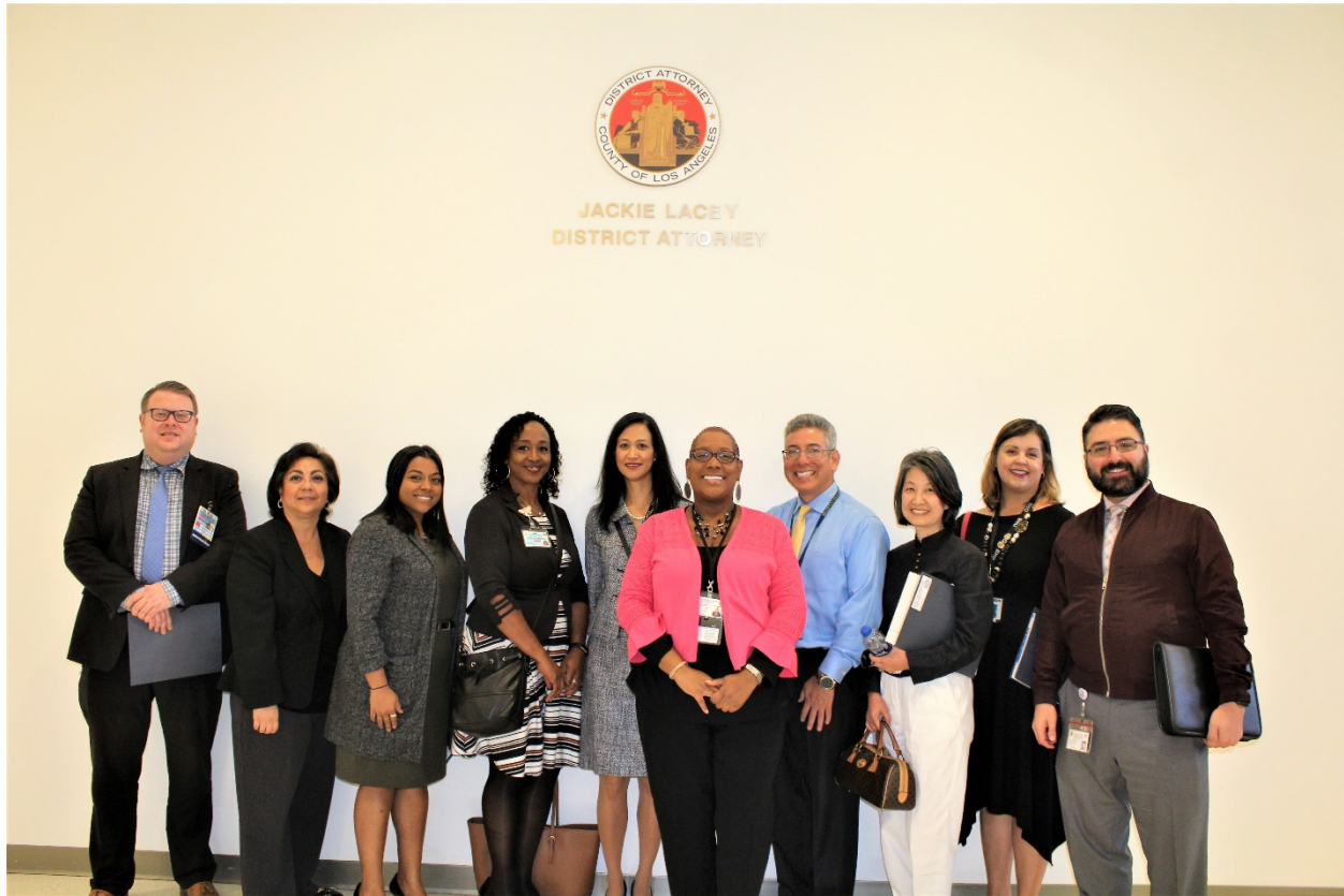
PMN Managers at the District Attorney's Office at the Hall of Justice