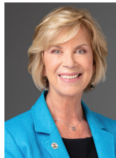
Janice Hahn Supervisor, Fourth District