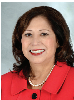
Hilda L. Solis Chair, Pro Tem Supervisor, First District

These directives are part of a comprehensive countywide effort, inclusive of partnerships with the community, businesses, and nonprofits, to identify actionable ideas to spur economic recovery.