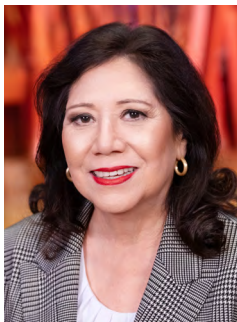
Hilda L. Solis Chair Supervisor, First District

These directives are part of a comprehensive countywide effort, inclusive of partnerships with the community, businesses, and nonprofits, to identify actionable ideas to spur economic recovery.