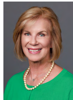
Janice Hahn Supervisor, Fourth District