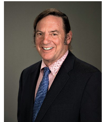
Quality and Productivity Commission