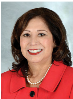
Hilda L. Solis Chair Pro Tem Supervisor, First District

These directives are part of a comprehensive countywide effort, inclusive of partnerships with the community, businesses, and nonprofits, to identify actionable ideas to spur economic recovery.