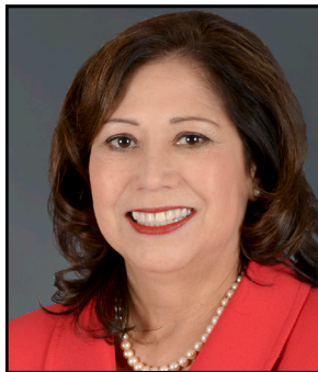
Hilda L. Solis Supervisor, 1st District