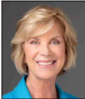
Janice Hahn Chair Supervisor, 4th District