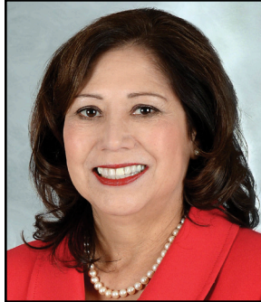
Hilda L. Solis Chair Supervisor, 1st District