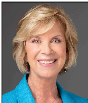
Janice Hahn Supervisor, 4th District