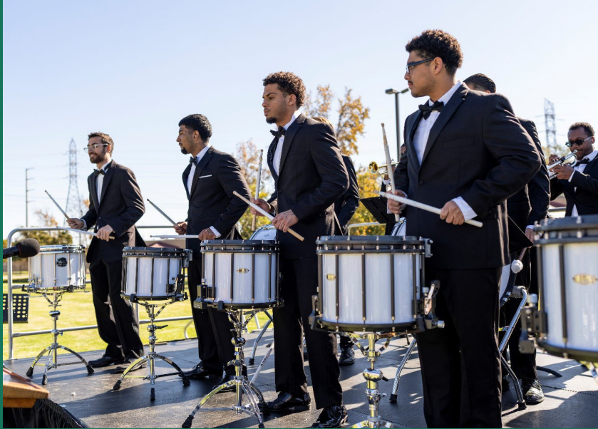
Inner City Youth Orchestra of LA Drum Corp Program at Barry J, Nidorf Juvenile Hall