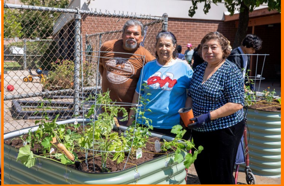
East LA Services Center, Community Garden