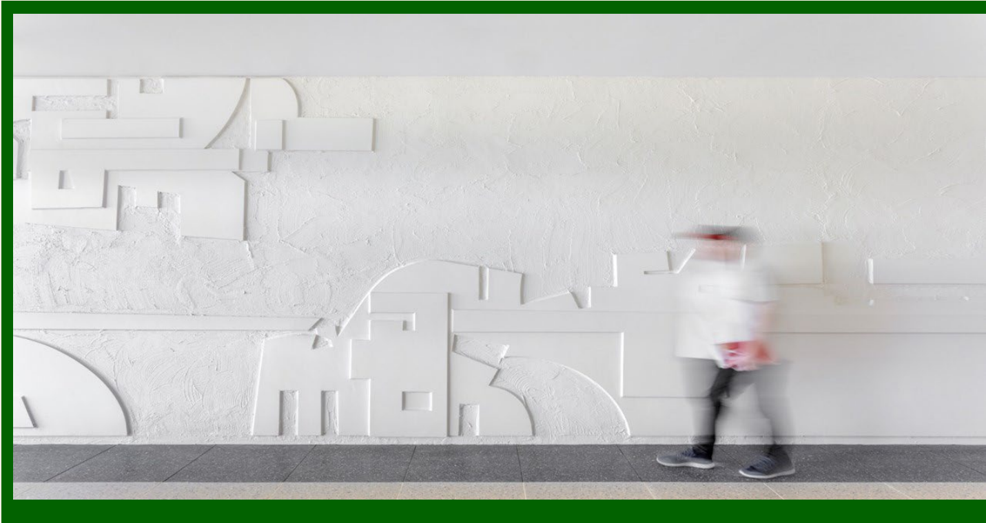
Untitled by Dora De Larios