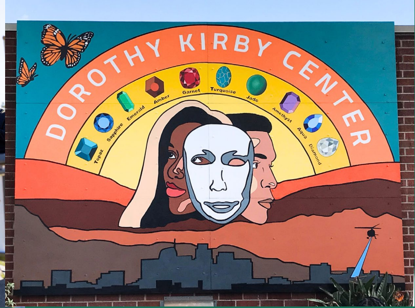
Spirit Awakening Foundation at Dorothy Kirby Center