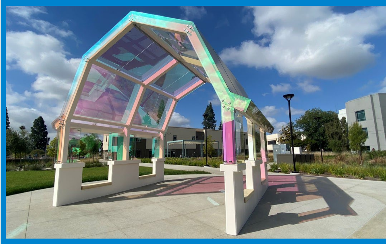
Wrapped in Sunbeams, 2022, Matthew Mazzotta Department of Health Services, Rancho Los Amigos Restorative Care Village