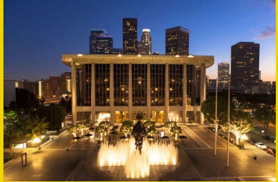
The Music Center