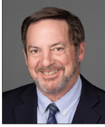
William B. Parent Chair