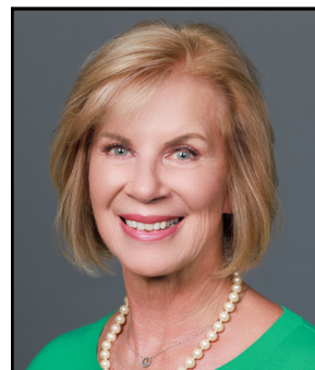
Janice Hahn Supervisor, 4th District