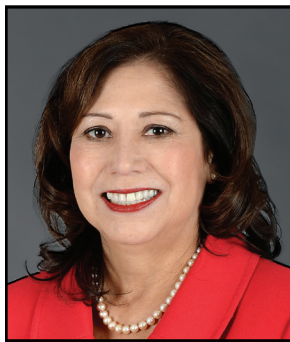
Hilda L. Solis Supervisor, 1st District