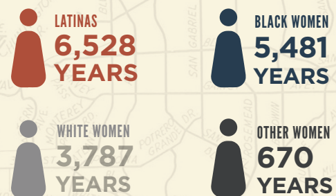
BOOKINGS OF WOMEN IN L.A. COUNTY JAIL BY SUPERVISOR DISTRICT (2010-2016)