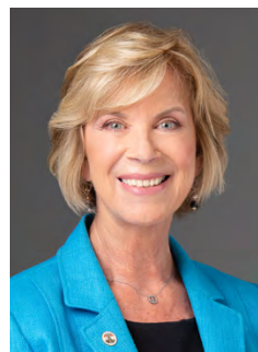
Janice Hahn Supervisor, Fourth District