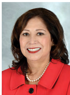
Hilda L. Solis Supervisor, First District

These directives are part of a comprehensive countywide effort, inclusive of partnerships with the community, businesses, and nonprofits, to identify actionable ideas to spur economic recovery.