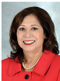
Hilda L. Solis Chair Pro Tem Supervisor, First District

These directives are part of a comprehensive countywide effort, inclusive of partnerships with the community, businesses, and nonprofits, to identify actionable ideas to spur economic recovery.