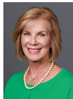
Janice Hahn Supervisor, Fourth District