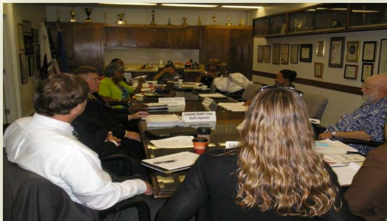
Monthly business meeting with representatives from DCFS, Probation, Sheriff, A-C and ISD.