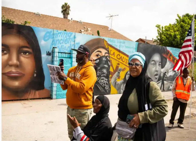
Community members attend LA vs Hate's press conference to launch the 7th annual United Against Hate Week on Friday, Sept. 20, 2024 in front of the "Unity Under the Sun" mural in Watts.

Over 200 cities nationwide — including Los Angeles — have committed to being "United Against Hate" through the week of civic action.