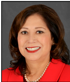
Hilda L. Solis Supervisor, 1st District