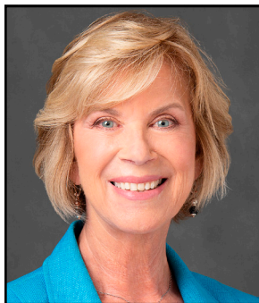
Janice Hahn Supervisor, 4th District