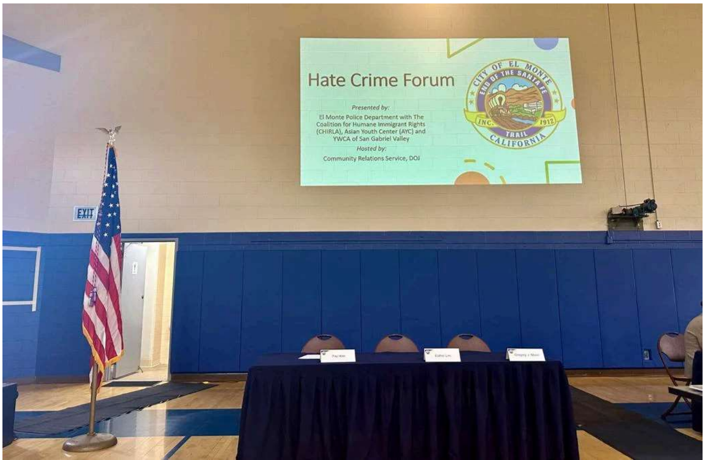
The forum was held inside Lambert Park's gym.

The forum also featured speakers from the Office of the United States Attorney for the Central District of California and the Federal Bureau of Investigation (FBI), who talked about the importance of reporting hate crimes and federal discrimination laws that protect everyone against discrimination in areas such as housing (the Fair Housing Act), education (the Civil Rights Act and Title IX), public accommodations (the Civil Rights Act of 1964, Title VI), voting (the Voting Rights Act) and employment (the Civil Rights Act of 1964, Title VIII).