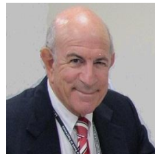
Commissioner Donald S. Andrews