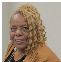
Commissioner Barbara Bigby