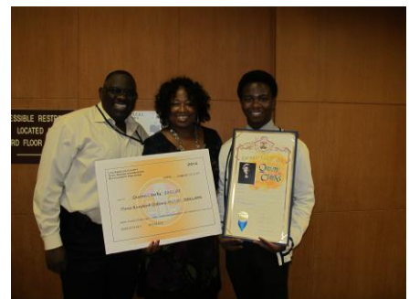
Scholarship Recipients and their family members