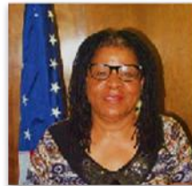
Commissioner Susan Burton