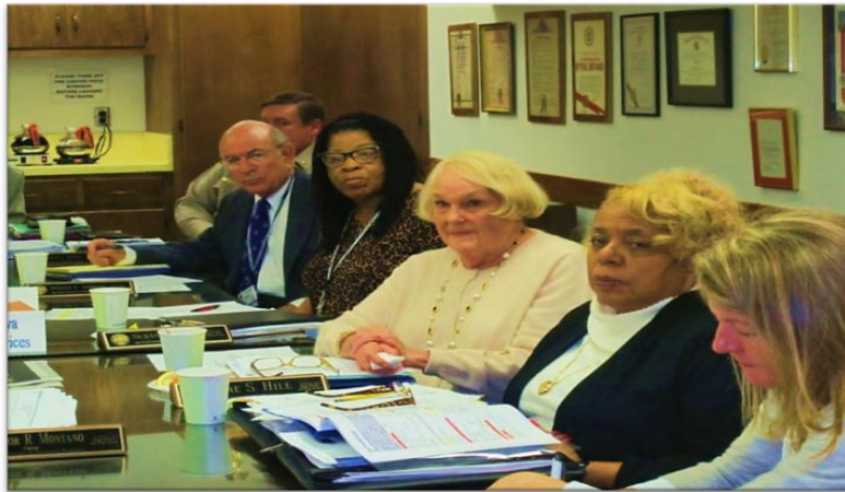
Members of the Commission deliberating on the inspection findings