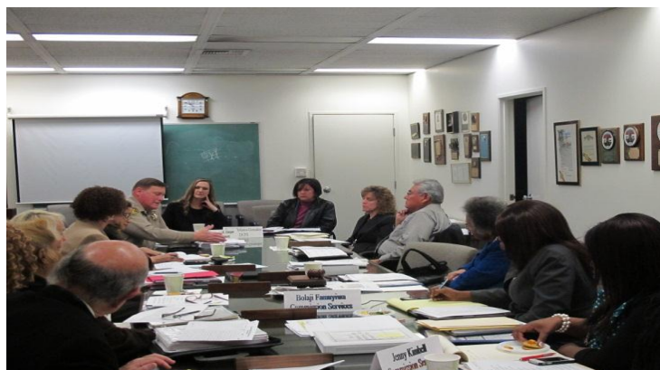
Monthly Business meeting with representatives from various County Departments